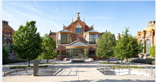
The Sant Pau Modernist Site

The complex was built between 1901 and 1930, and after Domènech i Montaner's death in 1923, the final stages were completed by his son, Pere Domènech i Roura. When inaugurated in 1930, the hospital became one of the largest and most innovative medical complexes in Europe. Architecturally, it is considered the largest ensemble of Art Nouveau architecture in the world and one of the masterpieces of Catalan Modernisme.